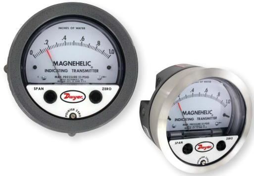
Note: Shown with optional -SS bezel. Backward compatible* with Magnehelic® gage.