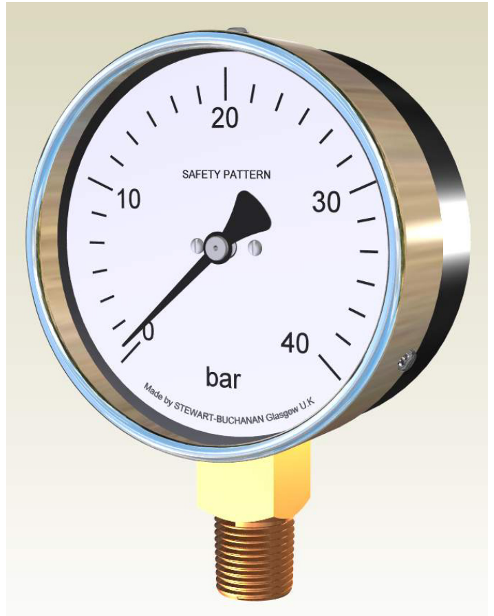
Model - 1012

State:- Pressure gauge model /Nominal size / Scale range / Size and location of connection / Optional extras reqd.