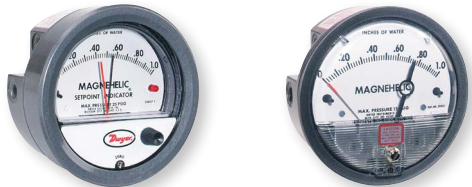
LED Setpoint Indicator