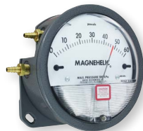
Integrated Mounting Plate