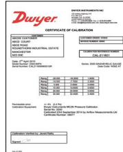
6-Point Calibration Certificate Included